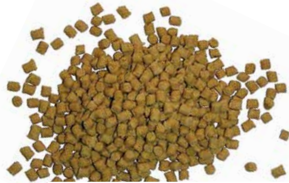
OvoControl ready-to-use kibbles are sized just right for pigeons.