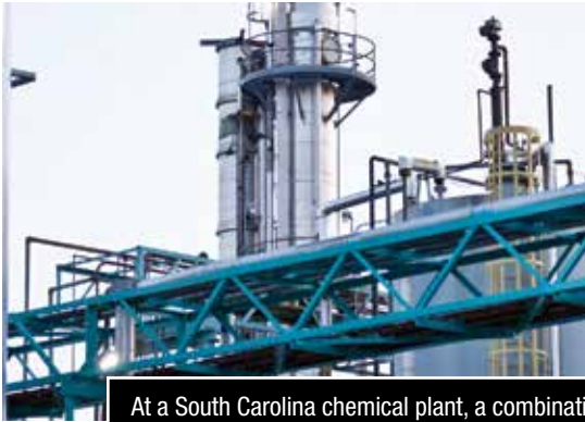
At a South Carolina chemical plant, a combination of OvoControl & live trapping reduced the pigeon burden to near zero over just 6 months.