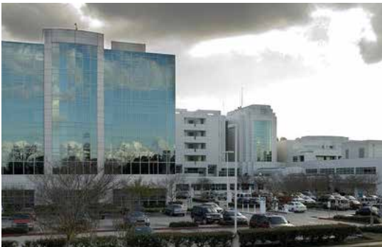
A Houston medical center used OvoControl as well as physical deterrents to rid the facility of a chronic pigeon problem.