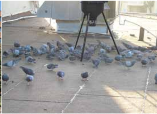
Feeders were placed on rooftops, targeting the larger flock and remaining unseen from below.