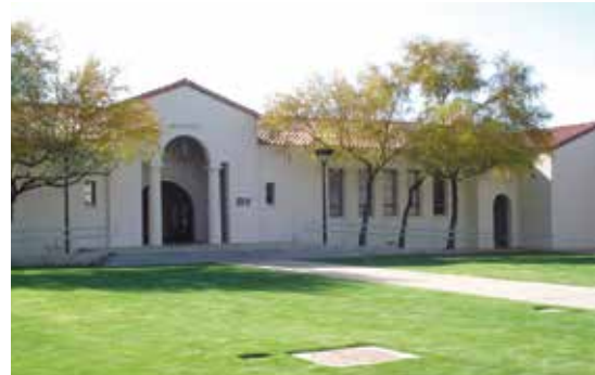
From 200 pigeons to just 5 over 24 months. This college remains essentially pigeon-free.