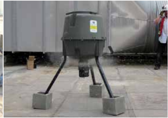
OvoControl feeders can hold up to 120 lbs of bait and broadcast kibbles 30 feet from the center.