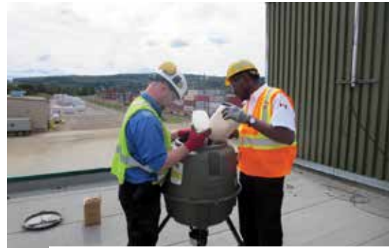
Technicians service an automatic feeder at a paper mill in Canada.