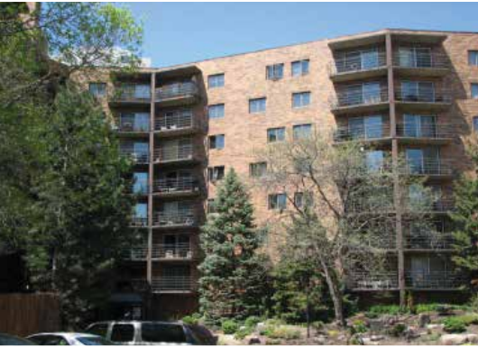
This condominium complex managed down its population of pigeons with one feeder on the rooftop.