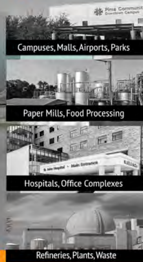
Campuses, Malls, Airports, Parks

OvoControl P is supplied in 30 lb. bags. Apply once daily with an automatic feeder at a rate of 1 lb. per 80 pigeons.