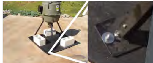
Feeder Mat OV-PG25

Heavy Duty 3/8" rubber mat protects sensitive roofs and secures the feeder to a flat surface. Features pre-punched bolt holes that match up to the feeder's feet for a bolted connection. Secure with bricks or other appropriate weights.