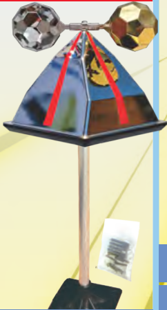
Eagle Eye 110V Red Kit EE-1PR

This kit includes a straight tube, metal mounting bracket and hardware kit.