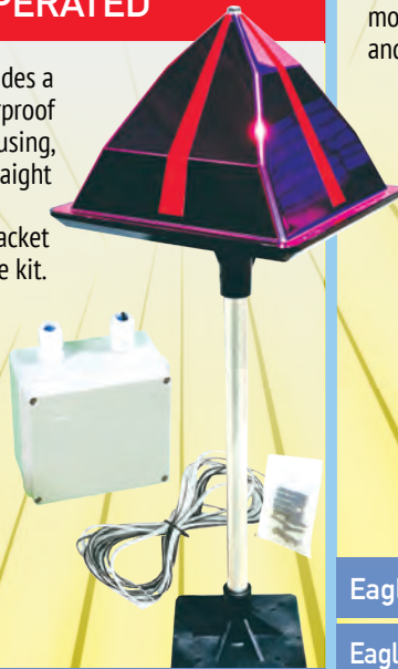
Eagle Eye 110V Red Kit EE-1PR

This kit includes a new weatherproof electrical housing, lead wire, straight tube, metal mounting bracket and hardware kit.