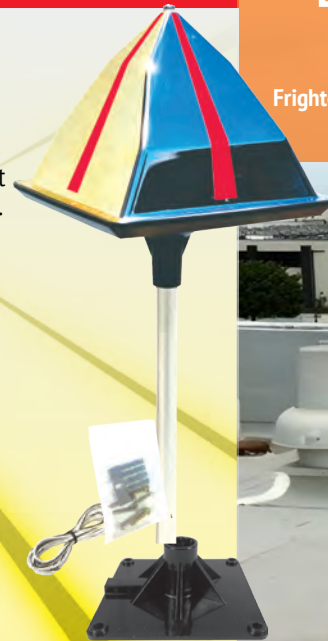
Eagle Eye Red Solar Kit EE-1SR

This kit includes a more powerful solar panel, lead wire, straight tube, metal mounting bracket and hardware kit.