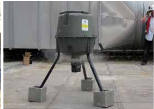
OvoControl feeders can hold up to 120 lbs of bait and broadcast kibbles 30 feet from the center.