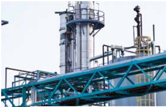
At a South Carolina chemical plant, a combination of OvoControl & live trapping reduced the pigeon burden to near zero over just 6 months.