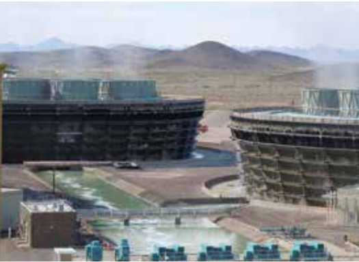
Even at the largest plants, OvoControl is an ideal tool to manage the population of birds.