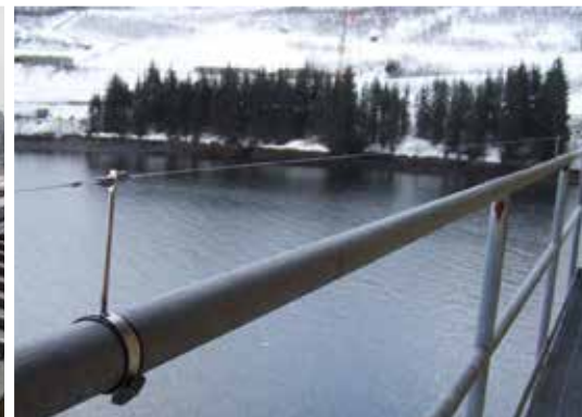
Railing clamps are attractive and easy to use on pipes and hand rails.