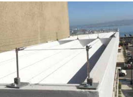
Birdwire, mounted with Glue-on-Bases screwed into this metal structure repels pigeons.