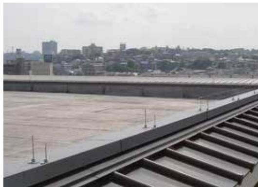
Two rows of Birdwire on this parapet cap provides low visibility protection from pigeons and large birds.