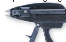
Sharp nosed tool pokes into the mesh to lock the Inserts in place. See page 15.

Spanish Tile Inserts (25) SP-EX25 Ringer Net Ring Tool TH-1500 9/16" Galv. Net Rings (2,500) TH-G150 9/16" S.S. Net Rings (2,500) TH-S150