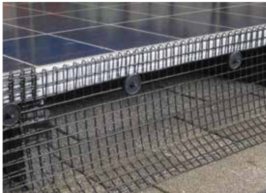
A fast and tidy installation. The attractive black mesh is locked in place by the Solar Panel Clips.