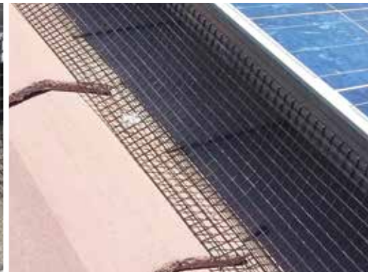
The mesh is secured on all sides, permanently excluding birds and other wildlife.

This innovative system is designed specifically to keep all creatures from getting under solar arrays, protecting the roof, wiring and equipment from their damage. This non-penetrating system is fast and easy to install, and can be removed for service.