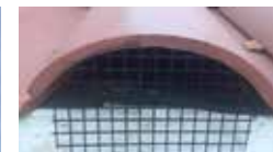
Block open ends under Spanish Tile. Staple or glue in place.

Fitting to Spanish tiles can literally double the labor time on a solar panel exclusion job. Cutting the wavy ups and downs is painstaking and inaccurate work. Our new egg-shaped "Spanish Tile Inserts", made from 1/2" PVC coated mesh, can be rotated, and bent, to fill every channel regardless of the shape or size. Zip tie or Hog Ring to the mesh for a secure hold.