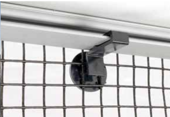
The Clip slides on to the frame under the edge of the solar panel. The disk locks the mesh in place.