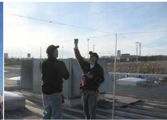
Wires are suspended high enough overhead to allow for unfettered access to the roof.