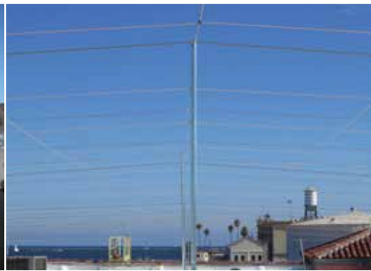
A sea of wires and lines turns the roof into a daunting challenge for large sea birds.